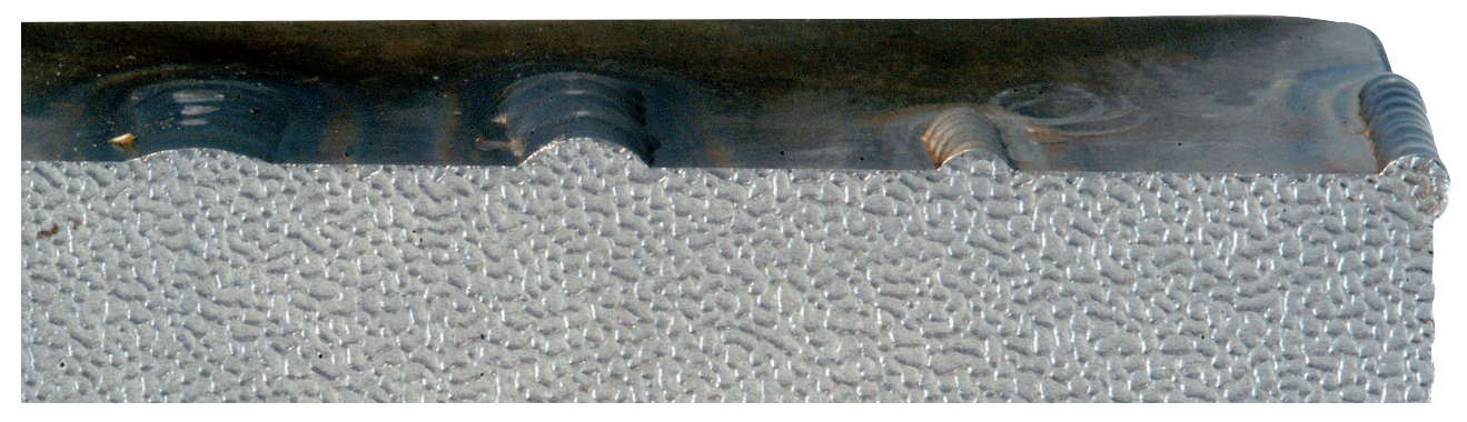
Welded and textured TOOLOX.

6. After the post-weld heat treatment the component shall cool in open air to room temperature.